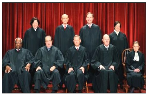
The nine current U.S. Supreme Court Justices.