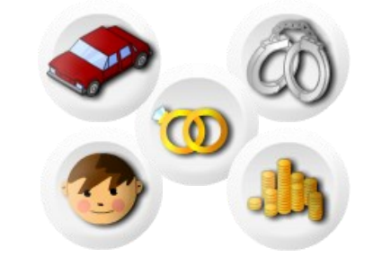
Most legal issues that people have get resolved in the state court system.

Each court system deals with certain kinds of cases. Federal courts hear cases involving federal laws, the U.S. Constitution, or disputes between citizens of different states. State courts hear cases involving state laws or the state's constitution. They also deal with disagreements between citizens of the state. State courts normally resolve the kinds of issues you hear about in everyday life, such as family matters, accidents, crimes, and traffic violations.