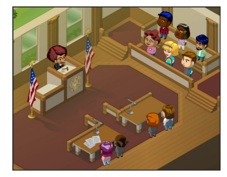
Which roles do you recognize?

The trial court is the first court to hear a case. Both the state and federal systems have trial courts. In the Federal system, the trial court is called a District Court. In the trial court, lawyers use evidence to try to prove that their client's side of the story is what really happened. Evidence can be almost anything—witnesses, videos, photographs, a letter, a piece of fabric, or even a murder weapon! In a jury trial , a group of twelve people listens to the evidence and decides who wins the case. That decision is called the verdict . In a bench trial there is no jury, so the judge gives the verdict.