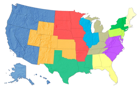
The federal system is divided into districts called circuits .