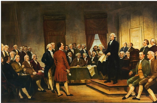
American leaders met in private to discuss what the new Constitution should include. An artist in the 1800s imagined what the scene might have looked like and painted this image of George Washington talking to the group. Washington was a federalist.

Leaders of the new United States of America have already written a Constitution that explains exactly how the new government will work. The only problem? It can't take effect until it's approved by the new states. And there are some state leaders who don't like it. Known as the Anti-Federalists , these people don't even like the Constitution. They fear a strong central government, and they are demanding that the Constitution include a list of citizens' rights. Without such a list, they warn the national government will violate people's rights. They're threatening to stop the Constitution from being approved unless a list is added.