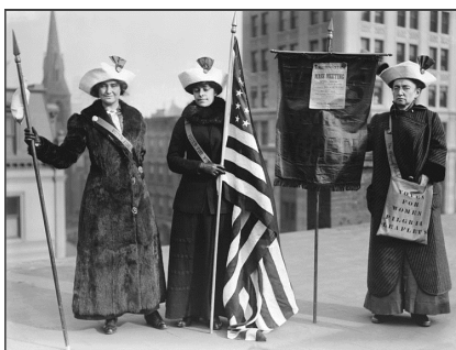
Suffragettes in the 1910s fight for women's right to vote. Women won the right in 1919.

As time went on, later amendments added more rights to the Constitution. Amending the Constitution is not an easy process—and it's not supposed to be. But the difficult process has meant that important rights were slow to evolve. After the bloody Civil War was fought between the northern and southern states, African Americans who had been enslaved in the United States gained their freedom. In the 1860s and 70s, the 13th, 14th, and 15th Amendments added rights for former slaves and people of color. In the 20th century, the 19th and 26th Amendments added voting rights for women and citizens as young as 18. Even today, people are campaigning to amend the constitution to add rights for groups that are still disadvantaged.