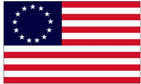
The first United States flag

The year is 1791. After a bloody war against the British, the American colonists have won their independence. The new Americans are excited, but some people are afraid about what rights they'll have under a new government. They've already suffered under the heavy hand of the British king. Now, some American leaders want to create a list of rights to define what rights American citizens will have.