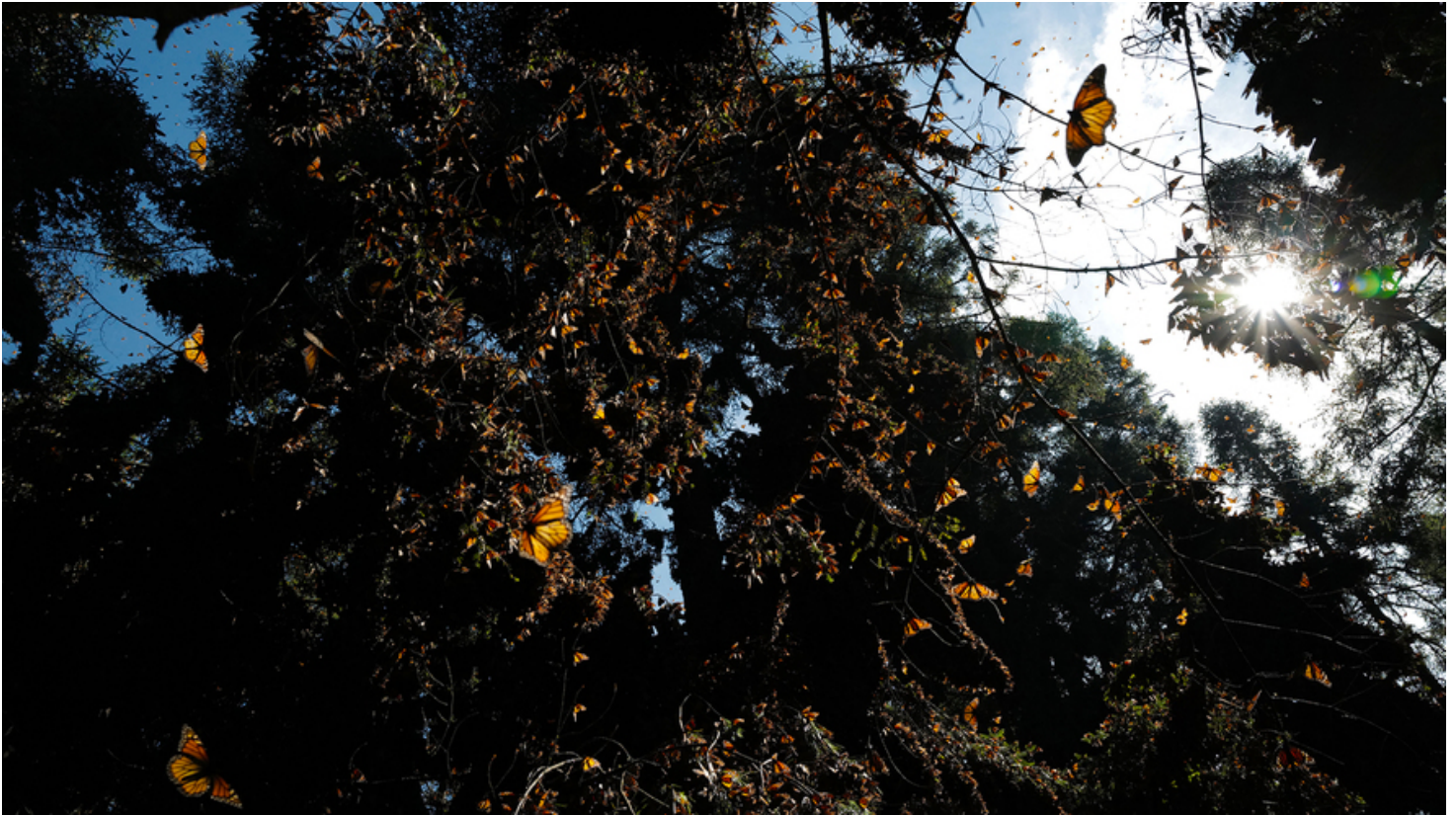
Image 1. Every year, millions of monarch butterflies migrate to the same remote stretch of forest in central Mexico, an event scientists have long thought of as a great wonder of the insect world. Now, however, the migration and the species itself are under threat from climate change.

Monarch butterflies are one of the oldest animals in the world. Each year they travel. They spend the summer in North America. Then they fly to Mexico. They stay there for the winter. The butterflies have made the trip for hundreds of years.