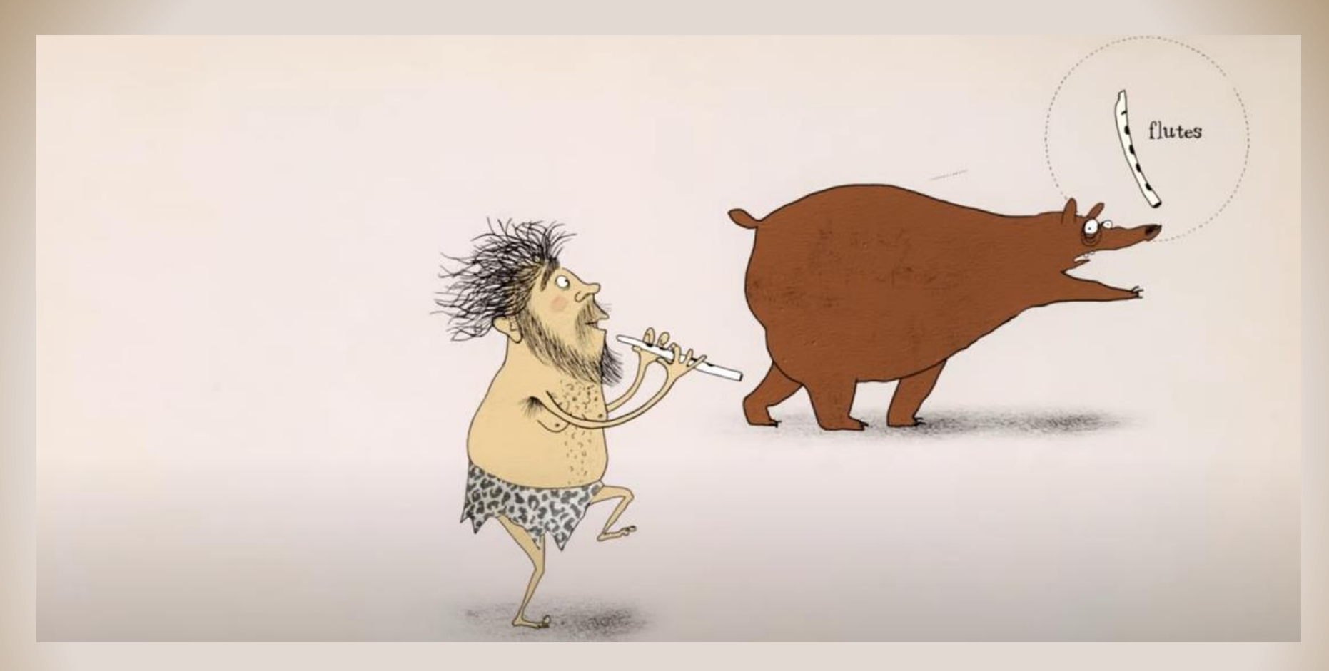
How did music begin? No one knows, but music is very old. Thousands of years in the past, early humans made instruments from animal bones.