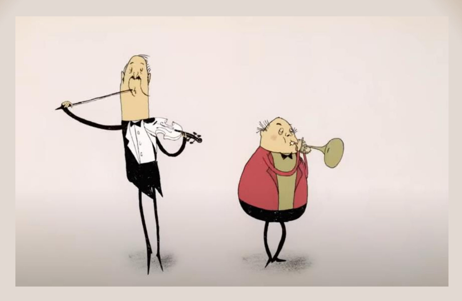
You can make a melody when you play one sound after another. If you play two sounds together, you make a harmony.