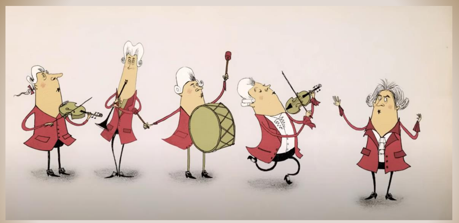
People started to have concerts. Before, people usually played music at their house or in church. Now people would pay to listen to music together.