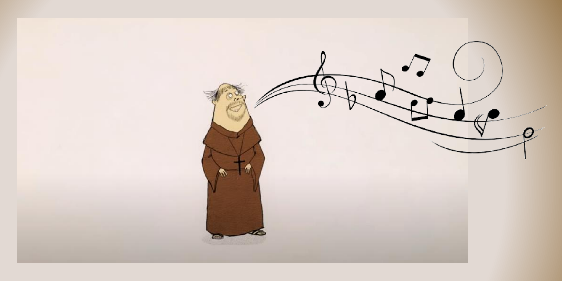
People started to use music for religion. For example, many monks sang and played music.