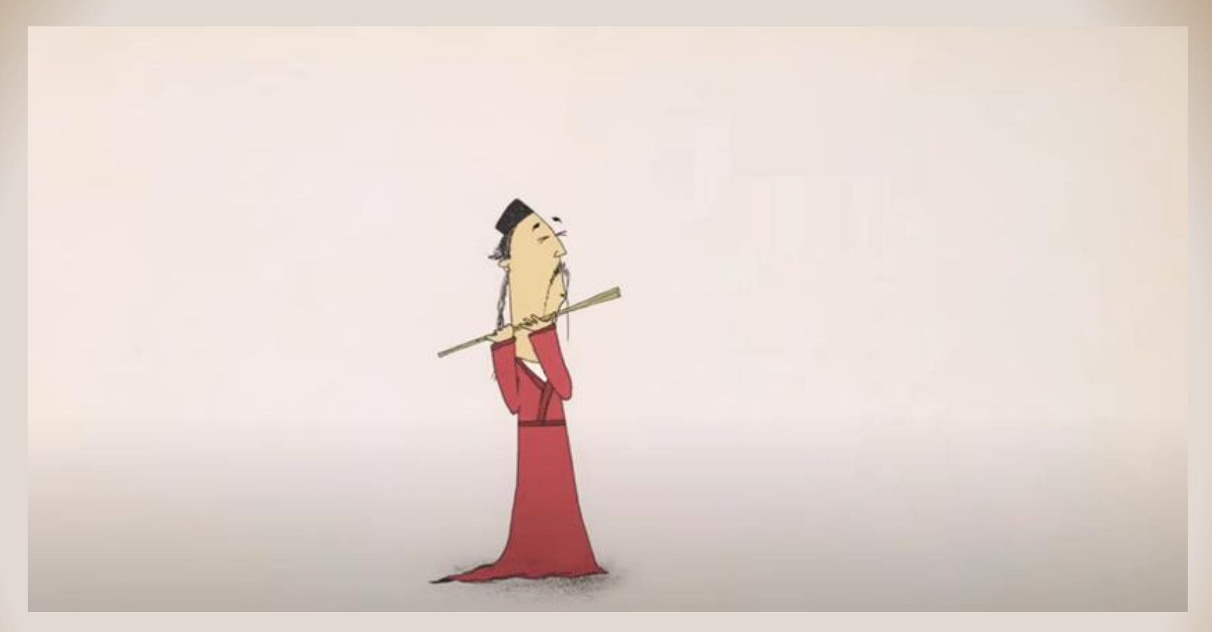
In 7,000 B.C., people in China made more complicated flutes. These flutes could play melodies.