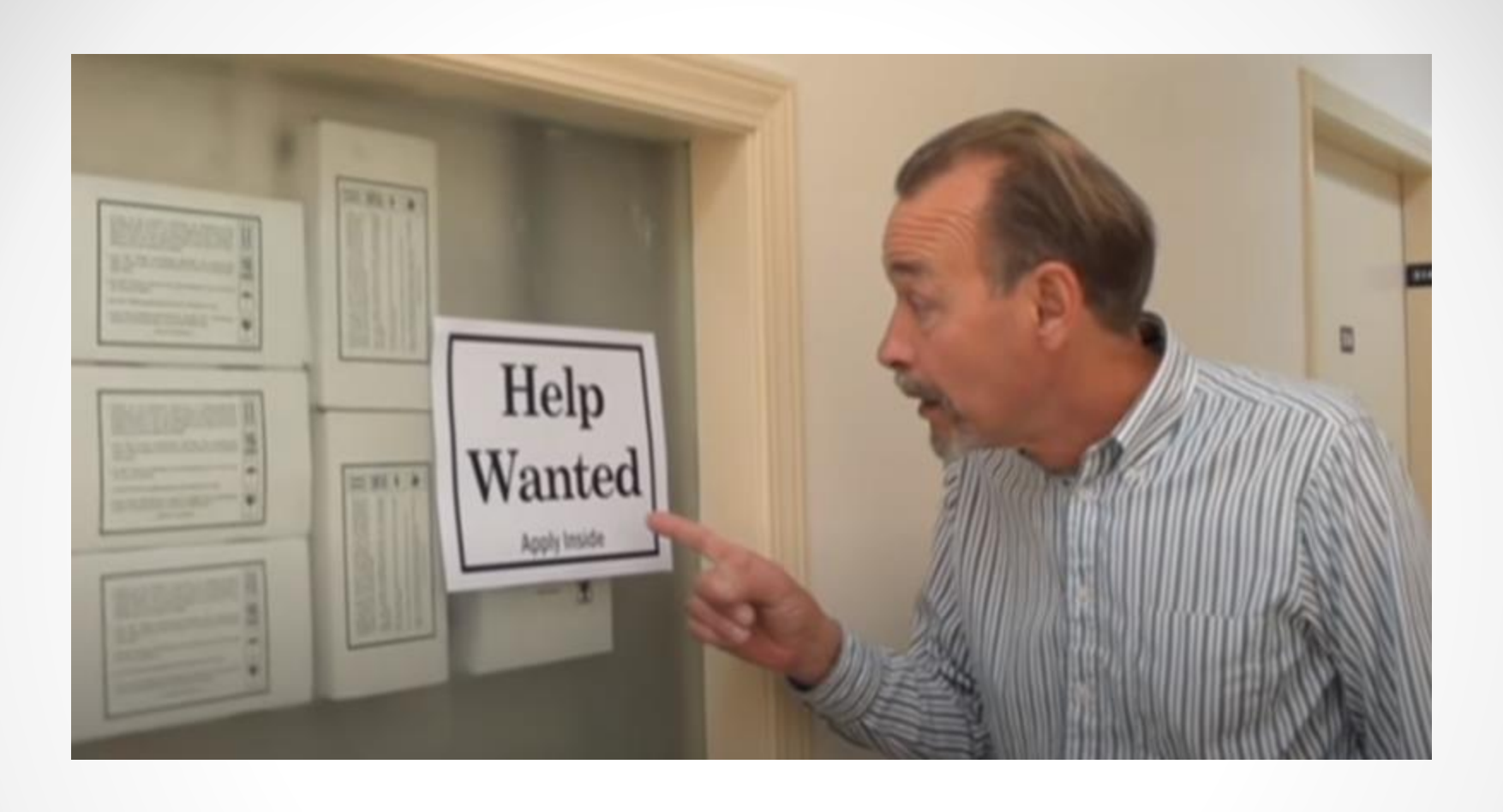
Greg is looking for a job. One day, he sees a sign that says: "Help Wanted. Apply Inside."