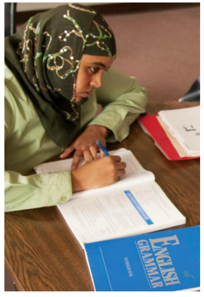
She studies English.