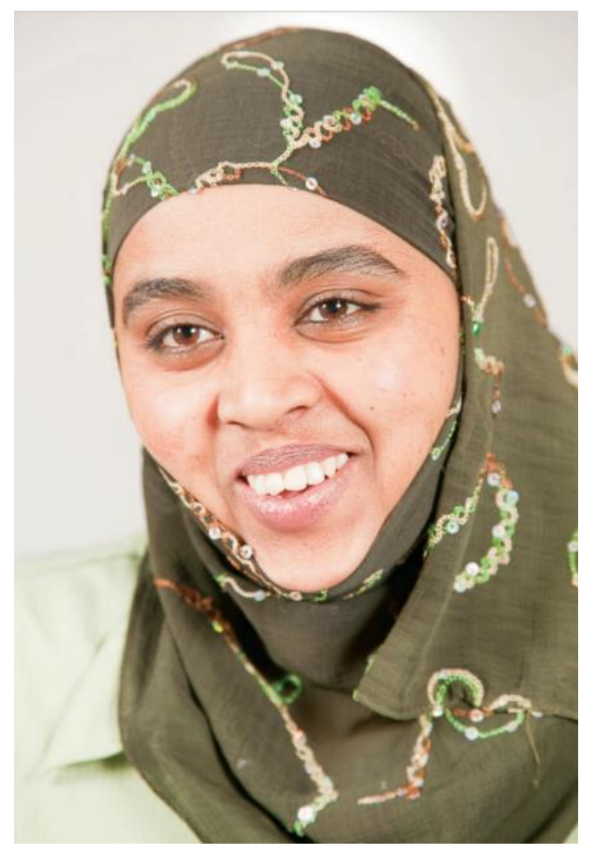
Sado likes school.