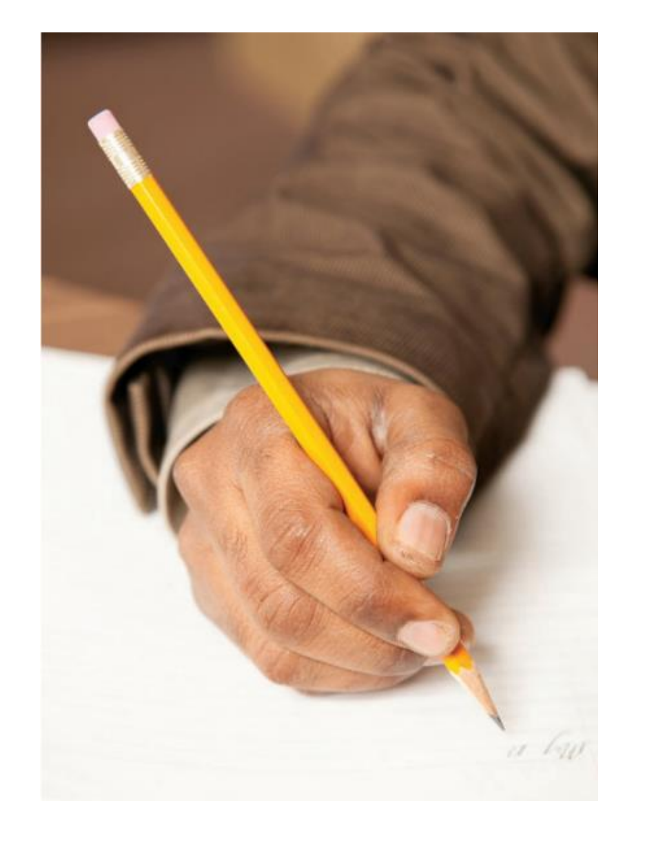
The students take out pencils.