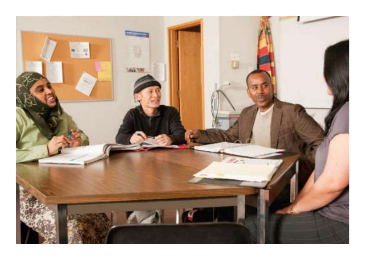
The students talk.